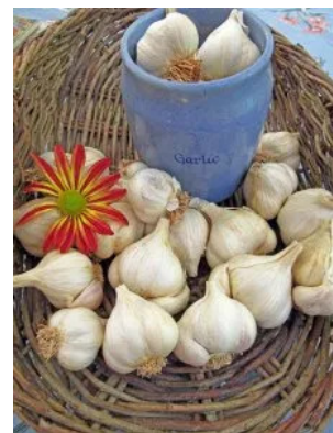
'Spanish White' garlic