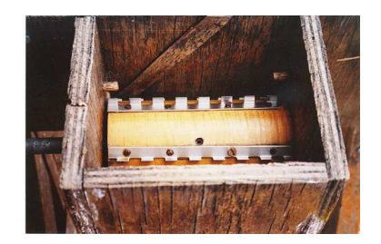
Figure 9. Throat of an apple grinder made from a kit.