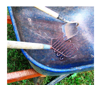
Figure 5. Hoe, wheelbarrow and hand mortar mixer for chopping and mashing peppers

This method works well for large hot peppers or large quantities of whole sweet peppers. Add the fruit and a small amount of water to a wheelbarrow. Chop the fruits with a hoe until fruits are thoroughly cut up, and then mash with a mortar mixer. A mortar mixer (shown in Figure 4) looks like an oversized potato masher. Dump the mash into a clean trashcan or 5-gallon bucket to ferment. A similar method is to core the sweet peppers and then add the fleshless cores to a 5-gallon bucket. Add enough water to cover the cores, ferment for 24 hours and then mash the cores. By doing the fermentation first, the seeds slip more easily from the cores and the mashing process is easier.