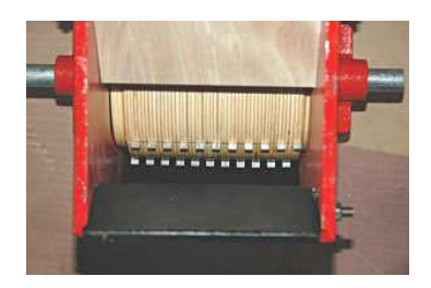
Figure 8. Throat of an apple grinder/press.