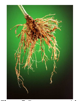
Figure 7: Pepper roots with extensive galling.

The most effective controls are soil solarization, crop rotation, sanitation, fallowing, and use of resistant varieties (for example 'Carolina Wonder' and "Charleston Belle'). A 2004 study by one of the developers of 'Charleston Belle' showed that not only did it repel